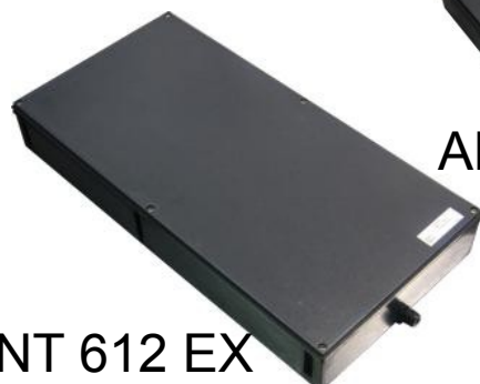
ANT 612 EX