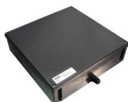
ANT 610 EX