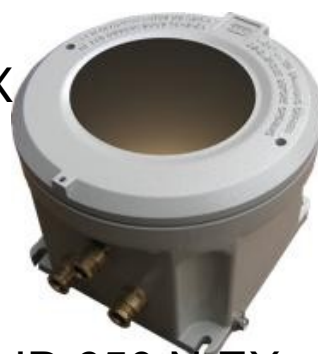
LID 650 N EX