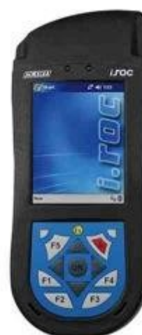
iroc 620 EX