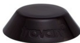
ID 310 G